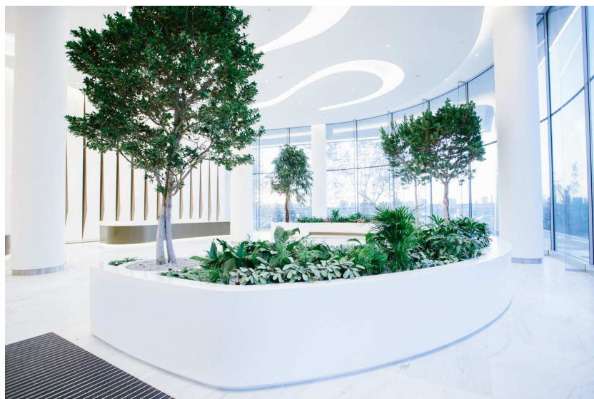
From the Societe Generale installation

Judge Greg Redwood commented "Societe Generale was a very impressive scheme, and the best I saw this year. Great variety in the range of plants chosen and all well-suited to their positions. The Strelitzia nicolai were growing superbly well and may even flower if allowed to continue to increase in height. There were also some superb quality replica plants in the darkest areas. The framing of the meeting/dining room balcony views was superb - the plants will thrive here. The reception area with the large asymmetrical white planting bed was one of the best individual features I saw this year. The ground level plantings on each floor was also highly unusual and very effective. Faultless (but exciting) plant and container selection."