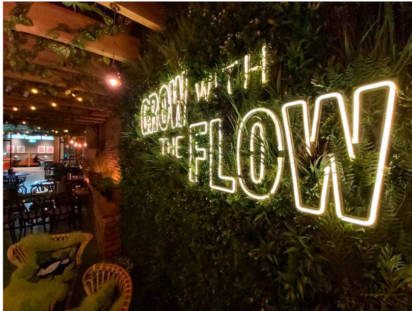
From The Marlin Hotel installation