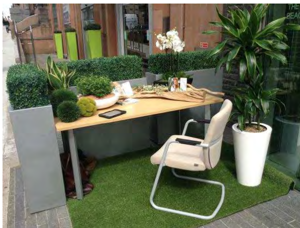
Pop-up office GP Plantscape

GP Plantscape built their pop-up office in a busy thorough fare in Glasgow; they reported 'loads of engagement and interest'. The team felt it was very worthwhile and wanted to do it every week' commented Jimmy Gilchrist.