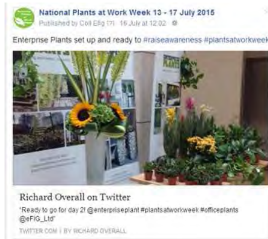
A snap-shot of Enterprise Plants pop-up office