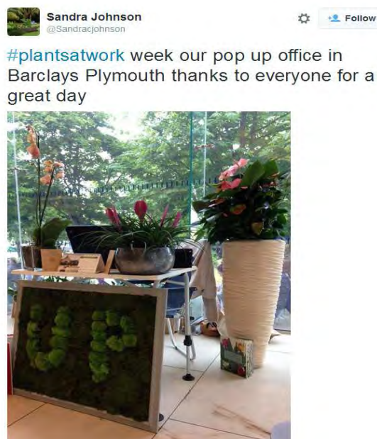
Urban Planters South West pop-up office